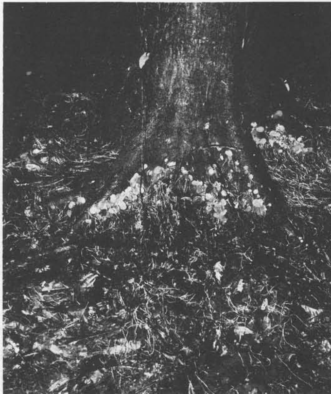
Fig. 1. Seedlings of Monstera gigantea converging upon a will-be host tree, at Finca La Selva, Costa Rica. Notice erect shoot tips; which serve to constantly apprise of host location relative to the minor diversions of forest floor debris.

at a single site. The capacity for lateral canopy movement, however, costs vines their self-supportive ability and presents arboreal species with the problem of finding a host tree to climb. Many biologists have been concerned with the mechanism of vine host location. Darwin interpreted his experiments with the vine Bignonia capreolata to show that hosts are found by